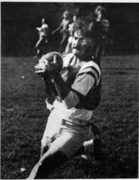
Harried quarterback gets set to pass during Tuesday's intramural football game.