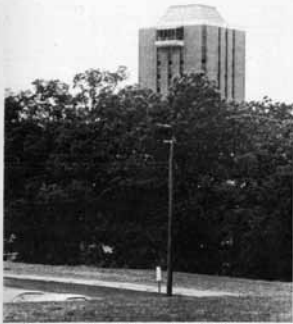
The scenic view of the new Faculty Towers.

DON'T FORGET - OCT. 4 & 5 - 9 am to 4 pm