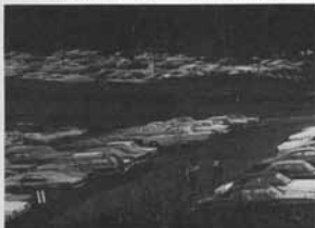
A panoramic view of the West parking garage when business is slow. Current Photo by Carl Doty