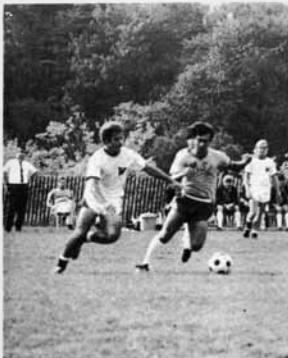
... Watch the elbow, fella. . .